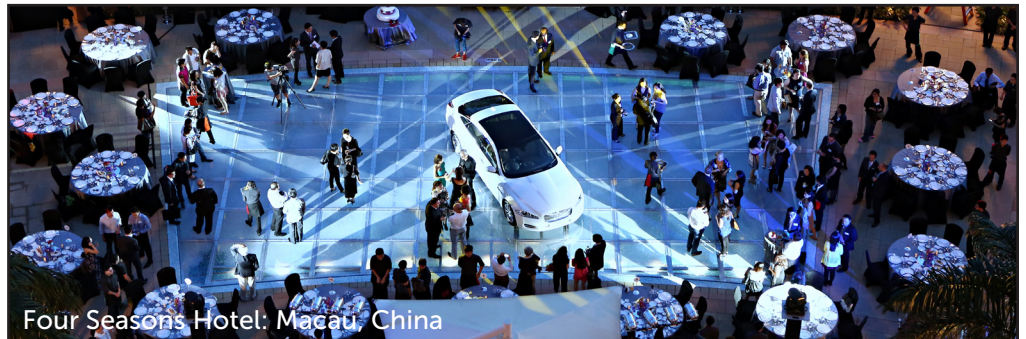
Four Seasons Hotel: Macau, China