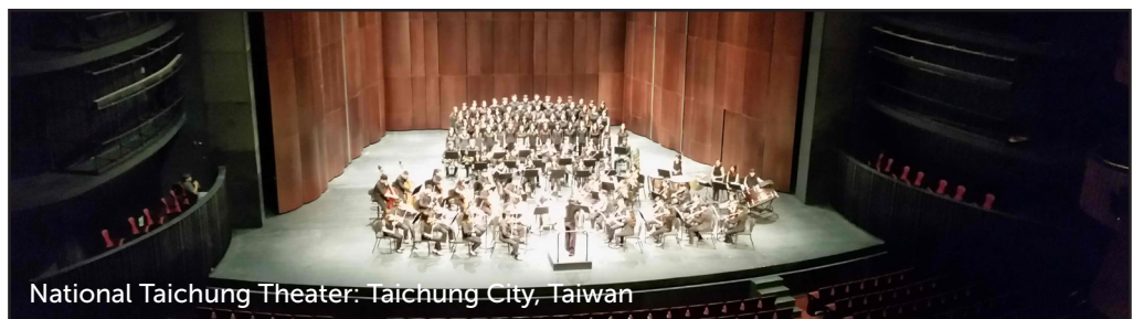
National Taichung Theater: Taichung City, Taiwan