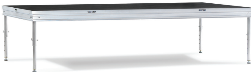
SC90 Platform with SC90 Adjustable Leg Supports