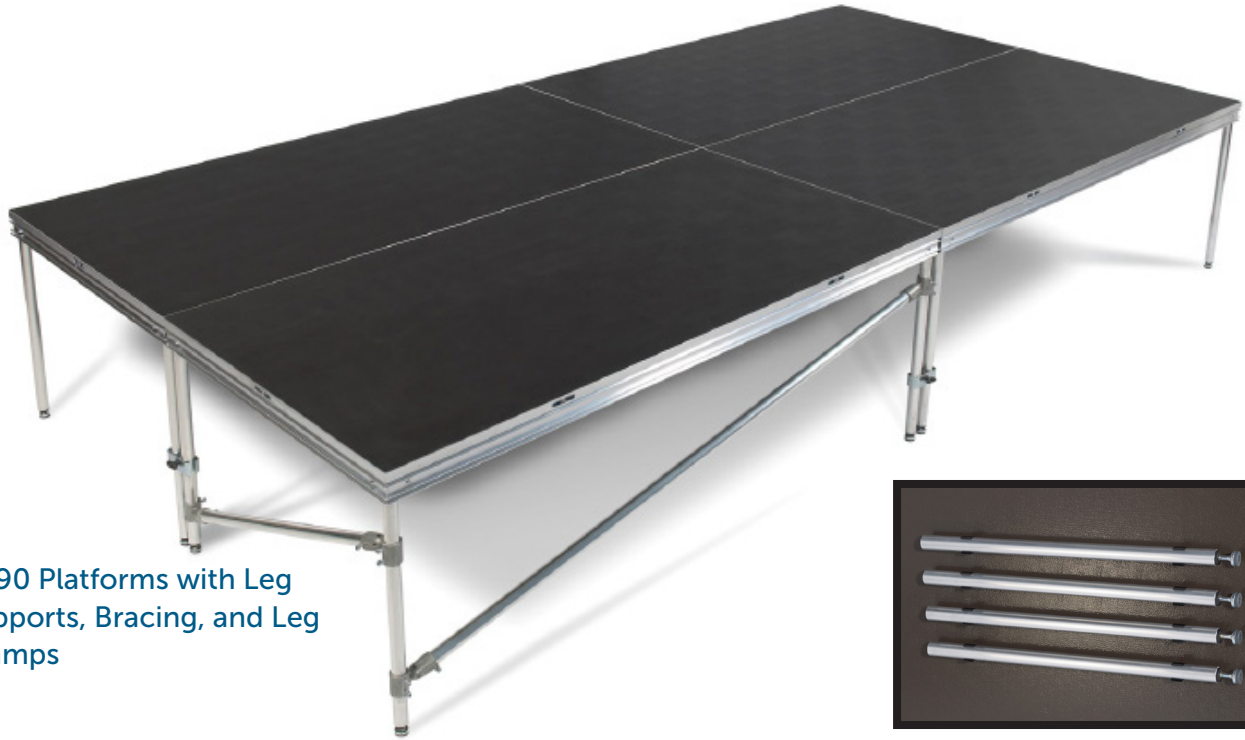
SC90 Platforms with Leg Supports, Bracing, and Leg Clamps

Our SC90 ® Leg Supports, used with the SC90, SC97, Riser, Trex ® , and Clima-Core™ Platforms, guarantee maximum durability and strength. The leg supports feature the same high quality aluminum that is used on our platforms. The leg supports are available in both fixed and adjustable heights, and have bracing and leg clamps available for extra stability and rigidity at higher elevations. In addition, our leg supports can be used with the most challenging custom applications on stages, seating, and drum riser systems.