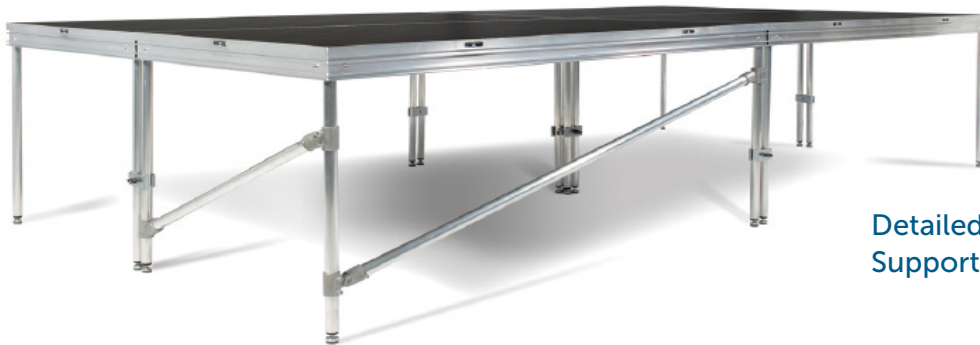
Detailed View of SC90 Leg Supports, Bracing, and Leg Clamps