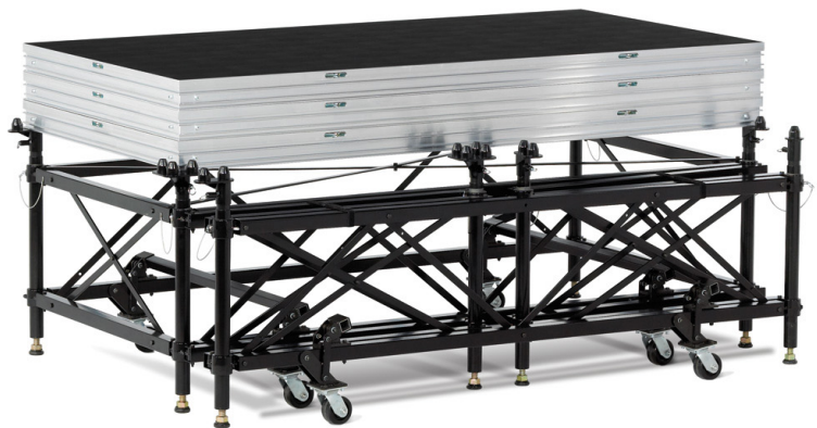
Multi-Functional Support Frame used as Platform Storage Cart