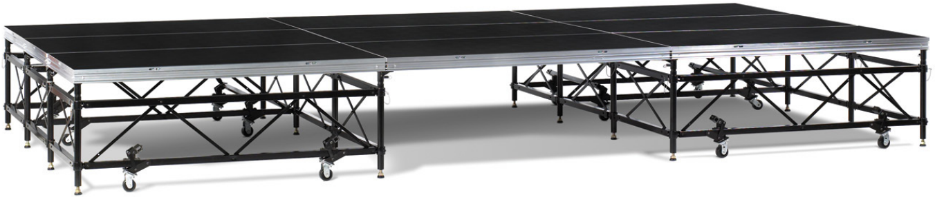
SC2003 Rolling Stage with Bridged Platforms

The SC2003 Rolling Stage has a retractable caster assembly to easily roll across a flat floor when completely assembled. The stage consists of a support structure and three 4' x 8' SC90 Platforms, creating an 8' x 12' area. Multiple rolling stages can bridge SC90 Platforms to create a larger performance area. When not in use, the support frames can be used as a platform storage cart (pictured below).