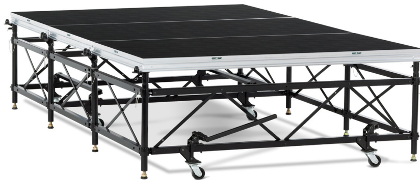
SC2003 Rolling Stage: 8' x 12'