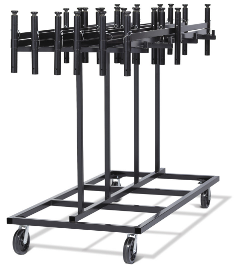
SC100 Storage Cart – Single Hanger