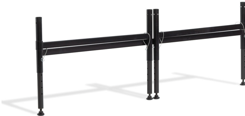
Folded C-Frame Unit