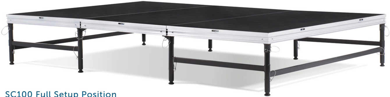
SC100 Full Setup Position

The SC100 Folding Bridge Frame, also referred to as a C-frame, is a functional frame that allows bridging between platforms, saving valuable setup time. The frame, which is available in fixed and adjustable heights, folds flat and is self-contained. Custom sizes are available and allow you to use the SC100 with the SC90®, SC97, Riser, Trex® or Clima-Core™ Platform.