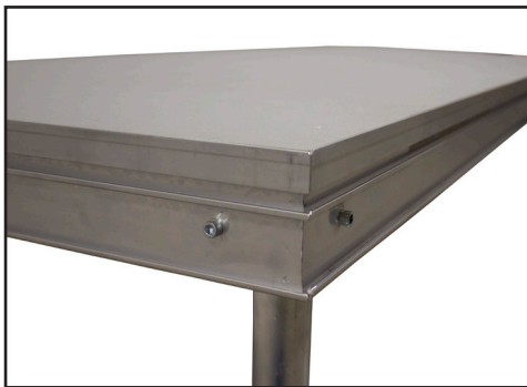
3/4" (19 mm) marinetech plywood substrate