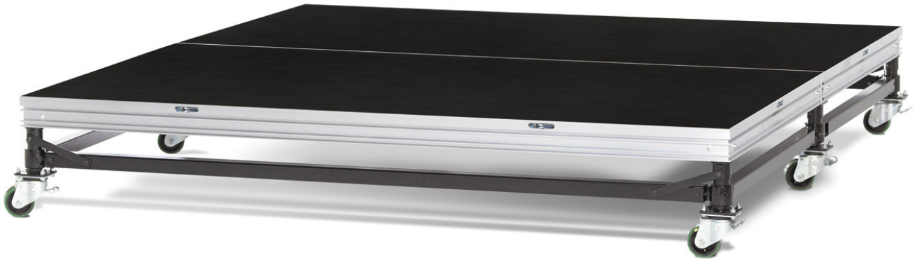
Rolling Drum Riser

Staging Concepts' Rolling Drum Riser complements your performance stage setup. Its understructure has dual locking casters to keep the riser in place during performances. When not in use, its understructure collapses for easy storage and transport. The Rolling Drum Riser is for use with SC90 Platforms.